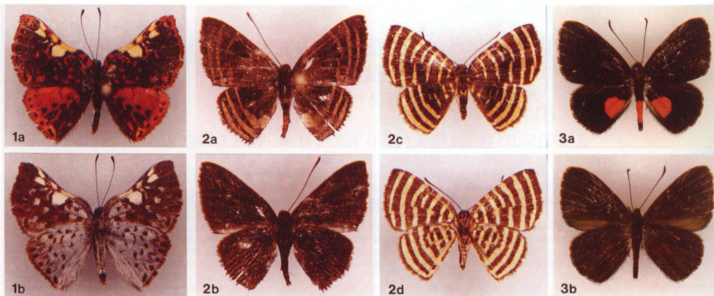
Fig. 1-3. 1. Symmachia busbyi Hall & Willmott, n. sp., holotype male, a) dorsal surface; b) ventral surface. 2. Symmachia emeralda Hall & Willmott, n. sp., holotype male, a) dorsal surface; b) ventral surface. Allotype female, c) dorsal surface; d) ventral surface. 3. Pirascca patriciae Hall & Willmott, n. sp., holotype male, a) dorsal surface; b) ventral surface.

from base of upper projection over aedeagus; aedeagus short and very broad, aedeagal cornuti consist of outwardly directed clusters of five long spines in upper left corner, four long spines in upper right corner, approximately eight long spines in lower right corner, and an "S"-shaped whirl of numerous, increasingly larger spines in central and lower left corner of partially everted vesica, pedicel produced into short posteriorly projecting "horn".