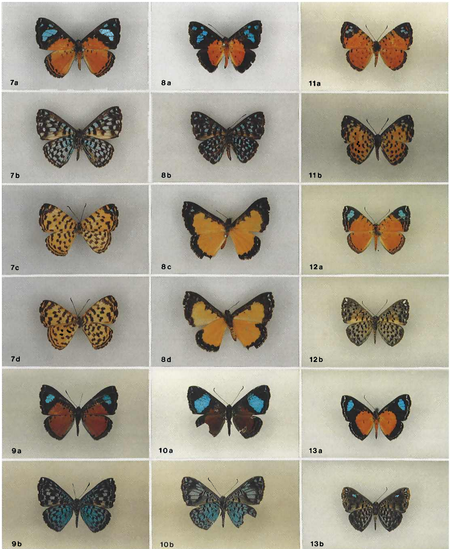
Fig. 7-13. Type specimens: 7. A. pulchra , type male: a) recto; b) verso. Type female: c) recto; d) verso. 9. A. natalita n. sp., holotype male: a) recto; b) verso. 10. A. caelestina n. sp., holotype male: a) recto; b) verso. 11. A. aparamilla n. sp., holotype male: a) recto; b) verso. 12. A. celata n. sp., holotype male: a) recto; b) verso. 13. A. bonita n. sp., holotype male: a) recto; b) verso.