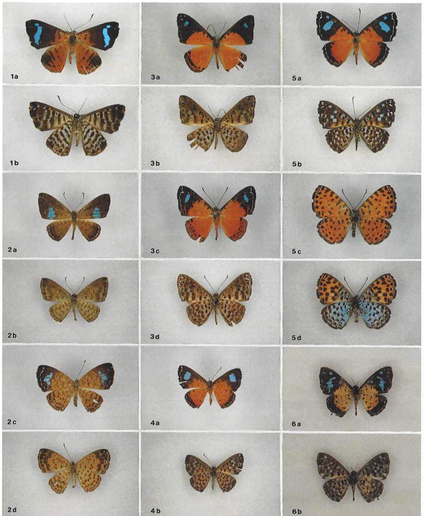
Fig. 1-6. Type specimens: 1. Argyrogrammana praestigiosa , type male: a) recto; b) verso. 2. A. barine , type male: a) recto; b) verso. Type female: c) recto; d) verso. 3. A. physis physis , type male: a) recto; b) verso. A. physis phyton , type male: c) recto; d) verso. 4. A. amalfreda , type male: a) recto; b) verso. 5. A. nurtia , type male: a) recto; b) verso. Type female: c) recto; d) verso. 6. A. alstonii , type male: a) recto; b) verso.