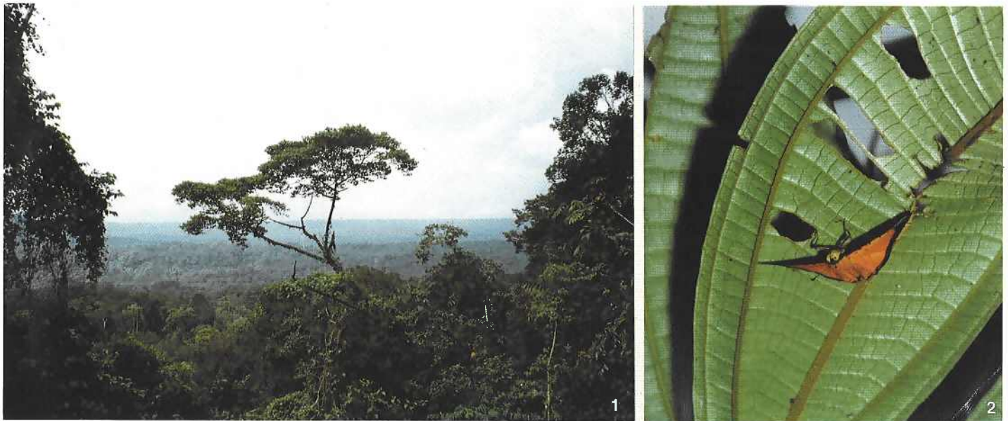
Fig. 1-2. La Punta, W. Ecuador: 1. View out over the canopy from the ridgetop site; 2. Symmachia wiltoni Willmott & Hall: male perching under a leaf.

KEY WORDS: behavior, Calospila , Central America, Colombia, Mesoamerica, Mesosemia hazelae n. sp., Neotropical, Panama, perching behavior, Symmachia wiltoni n. sp., Symmachiini, taxonomy, Theope iani n. sp., Theope pepo n. sp.