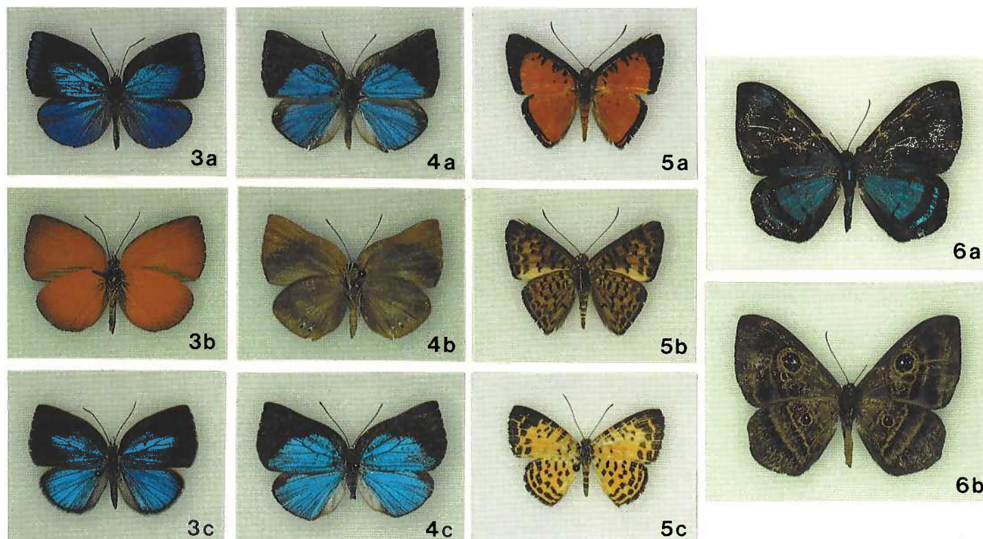
Fig. 3-6. 3. Theope pepo Willmott & Hall: a) holotype ♂, recto surface; b) holotype ♂, verso surface; c) allotype ♀, recto surface. 4. Theope iani Willmott & Hall: a) holotype ♂, recto surface; b) holotype ♂, verso surface; c) allotype ♀, recto surface. 5. Symmachia wiltoni Willmott & Hall: a) holotype ♂, recto surface; b) holotype ♂, verso surface; c) allotype ♀, recto surface. 6. Mesosemia hazelae Willmott & Hall: a) holotype ♂, recto surface; b) holotype ♂, verso surface.

towards tornus, interrupted by black vein endings. Hindwing purple, fading to lustrous blue basally, costal margin black. Verso: both wings dark "pumpkin" orange, distal margins slightly darker, dorsal margin of forewing light brown. Labial palpi recto black, verso yellow. Eyes brown and bare. Antennae dark brown with white flecks, tip of club light brown. Thorax and abdomen recto dark grey, verso pale yellow. Genitalia (Fig. 7a-b): uncus short and setose; falces compact and rounded, valvae triangular, tips blunt; aedeagus long, pointed and flattened posteriorly.